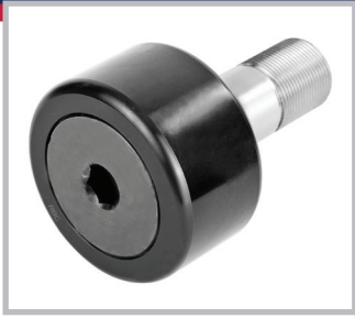
Cam Followers for Topdrives