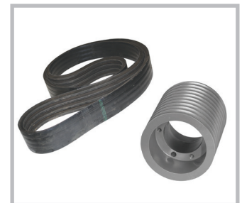
V-belts and V-belt Sheaves for Mud Pumps