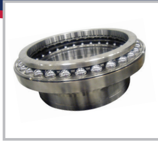
Rotary Table Bearings