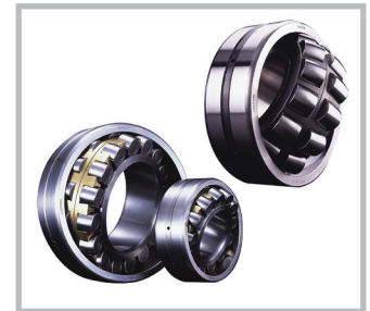
Spherical Bearings for Mud Pumps and Drawworks