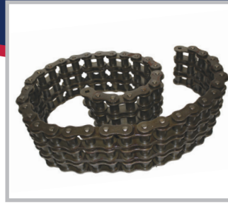
Roller Chain for Drawworks & Mud Pumps