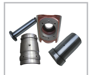
Crossheads, Crosshead Slides & Pins for Mud Pumps