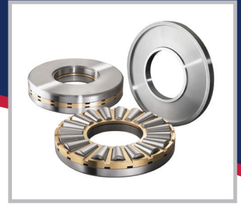
Thrust Bearings for Top Drives & Swivels